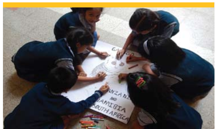
Friendly Flora n Fauna