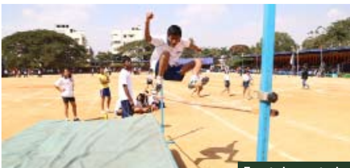
Events in sports day