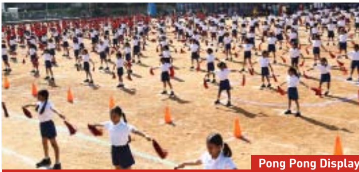
Pong Pong Display