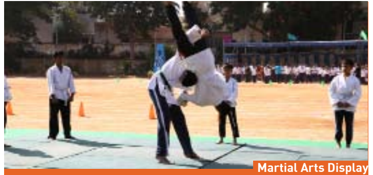
Martial Arts Display