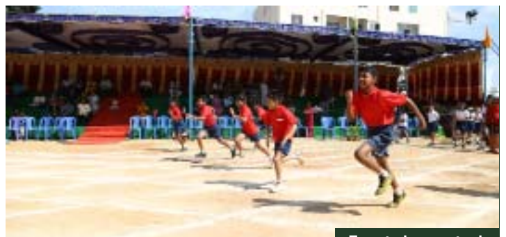
Events in sports day