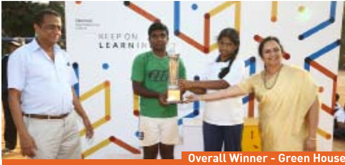
Overall Winner - Green House